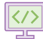
Professional Project Support